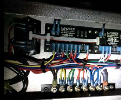
Multiplexed Wiring System