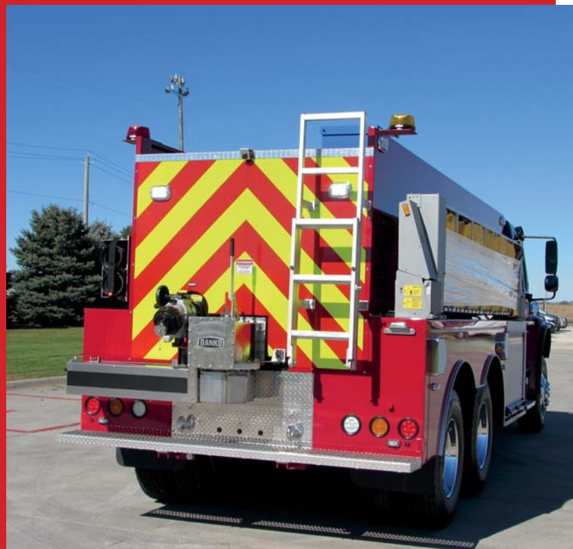
Best Swivel Dump in the Industry 180° swing • Locks for Travel • High Ground Clearance