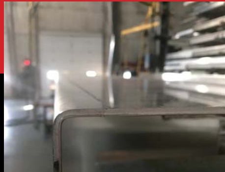
Strong 3/16" Aluminum Bodies