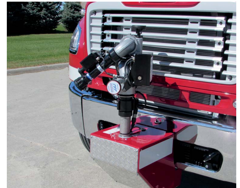
Bumper Turret Utilize in Stationary or Pump & Roll Applications