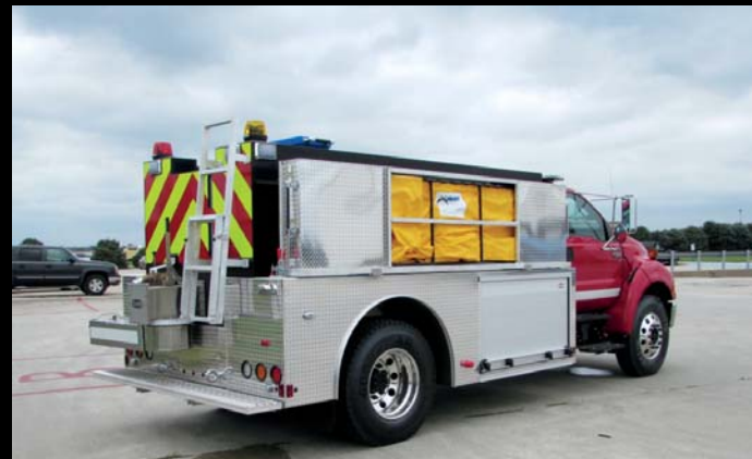
Portable Tank Storage - Available in Manual or Electric Drop Down Racks