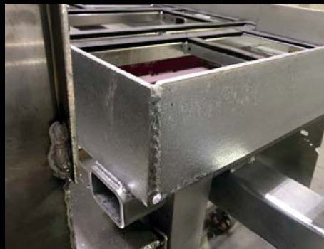
Hot-Dip Galvanized Subframes Corrosion Prevention Process Strong Foundation